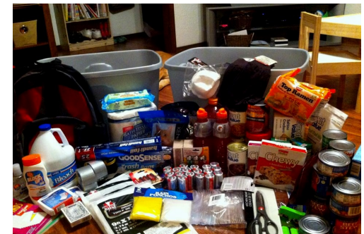
Sample Disaster Supply Kit

Independence: Children who are too young to care for themselves and Older Adults who need assistance with their activities of daily living